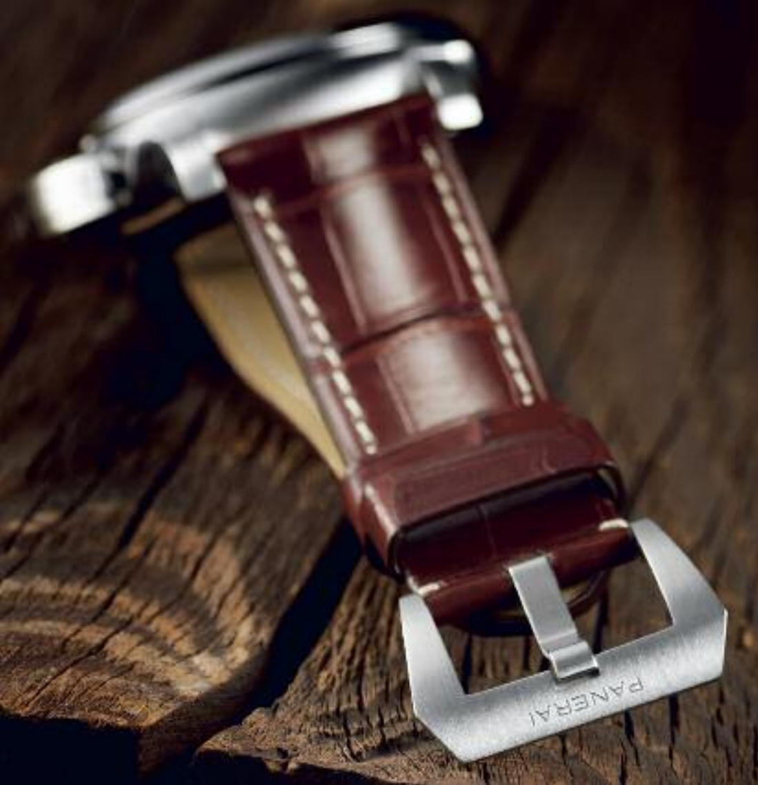
The Luminor's pronged buckle is nearly as large as a belt buckle.

The bidirectionally winding rotor uses pawls and runs over low-wear ceramic ball bearings. It supplies power to the barrels, which (as the watch's name indicates) amass enough energy to keep the watch running for 72 hours. A total of 227 components — including 29 jewels for ideal reduction of friction — comprise the movement. Four screws along the rim provide the solution to the problem of finely adjusting the balance without the need for an index tail. Until a few years ago, this detail was reserved for watches in the upper echelons of haute horlogerie .